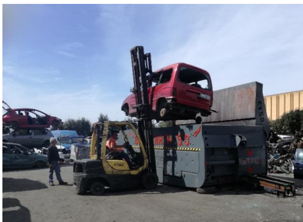
Possibility of loading with forklift