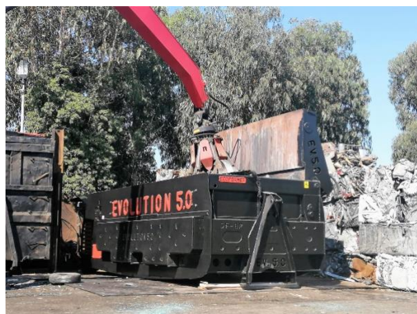
Easy unloading with material handler