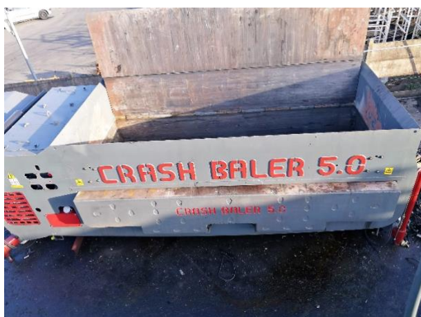
Large charging box