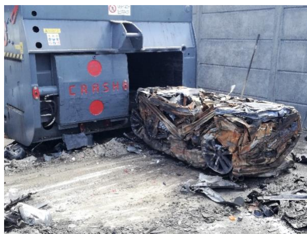
High compaction force