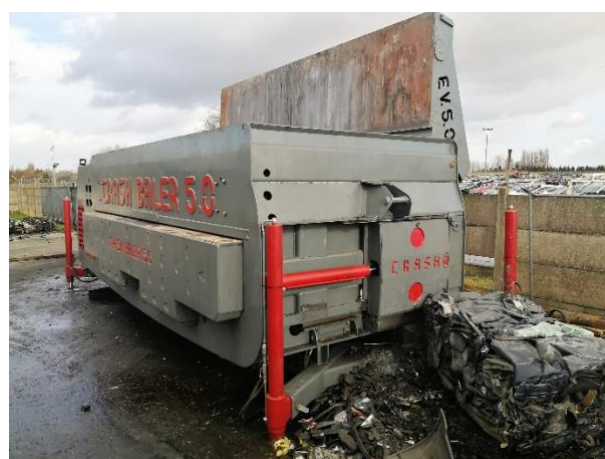
EJECTION DOOR WITH LEGS

Armatek s.r.l. Sede legale: Via Lungotevere, Ripa n° 3/B c.a.p. 00153 - Roma - Italy